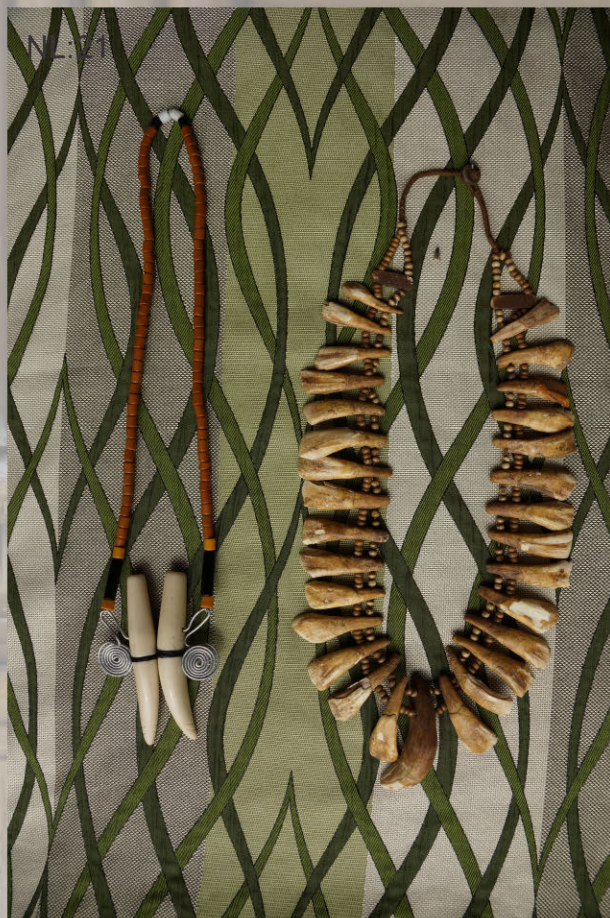
NL:21 Local Name: Tribe: