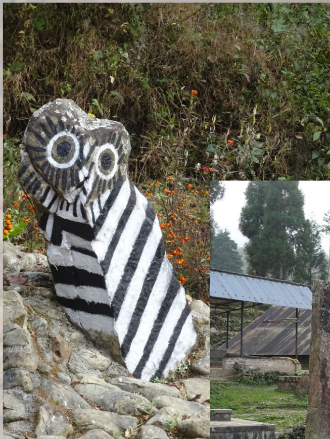
Sculpture made to appease ghosts