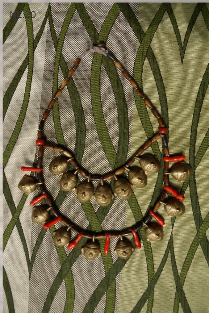
NL:20 Local Name: Tribe: Konyak