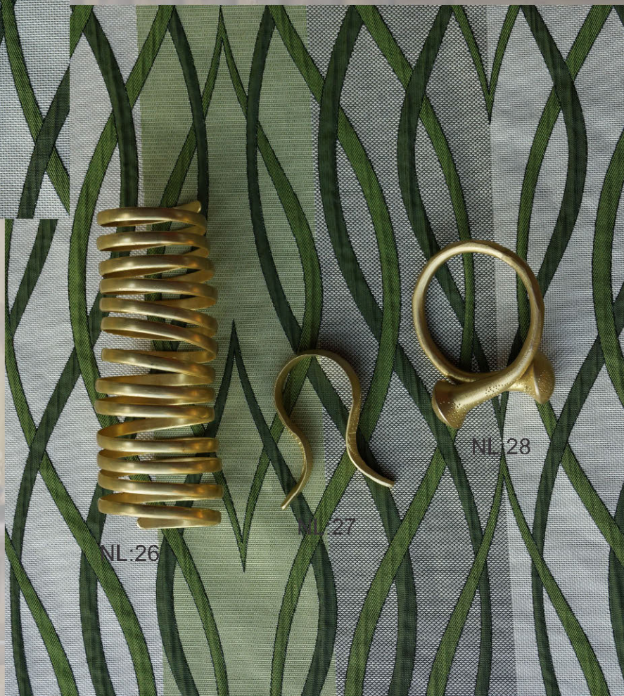
NL:27 Local Name: Tribe: