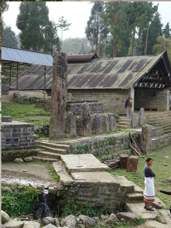
Morung with Monoliths near Kosoma village