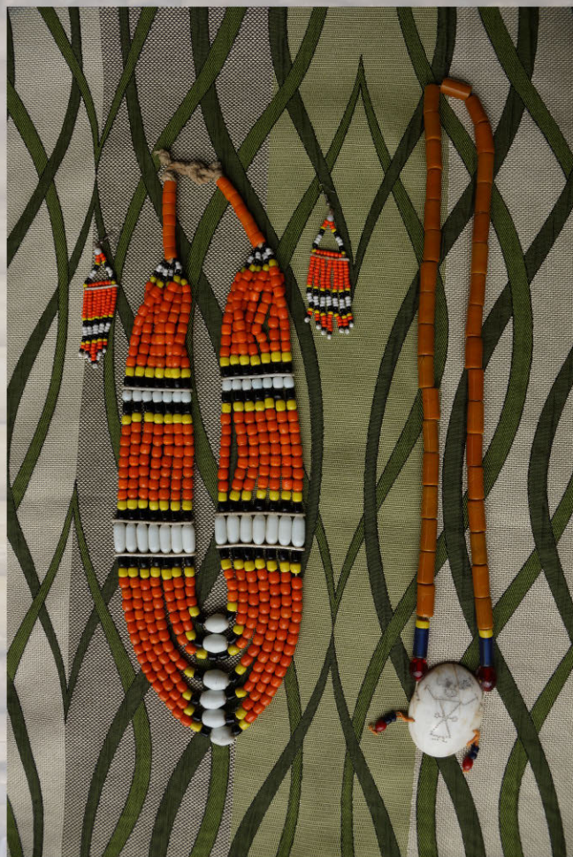
NL:24 Local Name: Tribe: