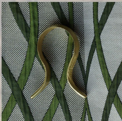
NL:26 Local Name: Epharumpem Tribe: Sumi / Lotha / Angami