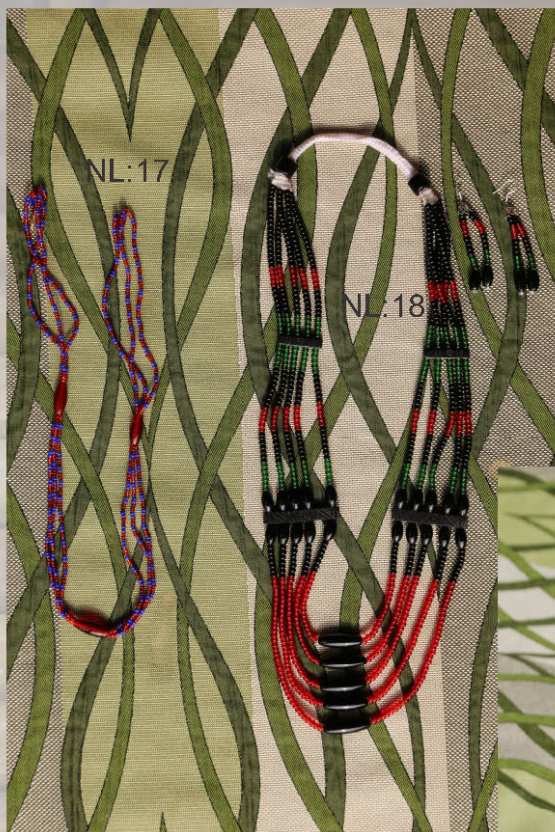
NL:17 Local name: Azuk Tribe: AO