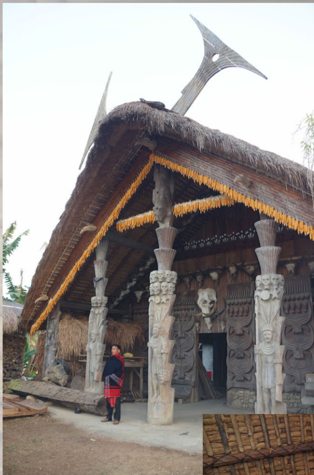
Tribal Morung with Elephant, Deer, and Mithum skulls.