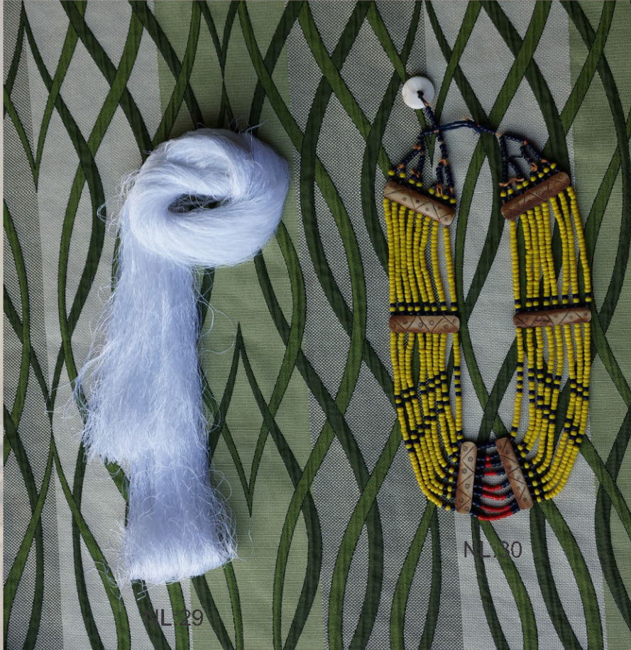
NL:29 Local Name: Kulang Tribe: AO (Hair Ornament)